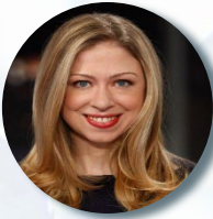
Chelsea Clinton, DPhil, MPH Vice Chair CLINTON HEALTH ACCESS INITIATIVE